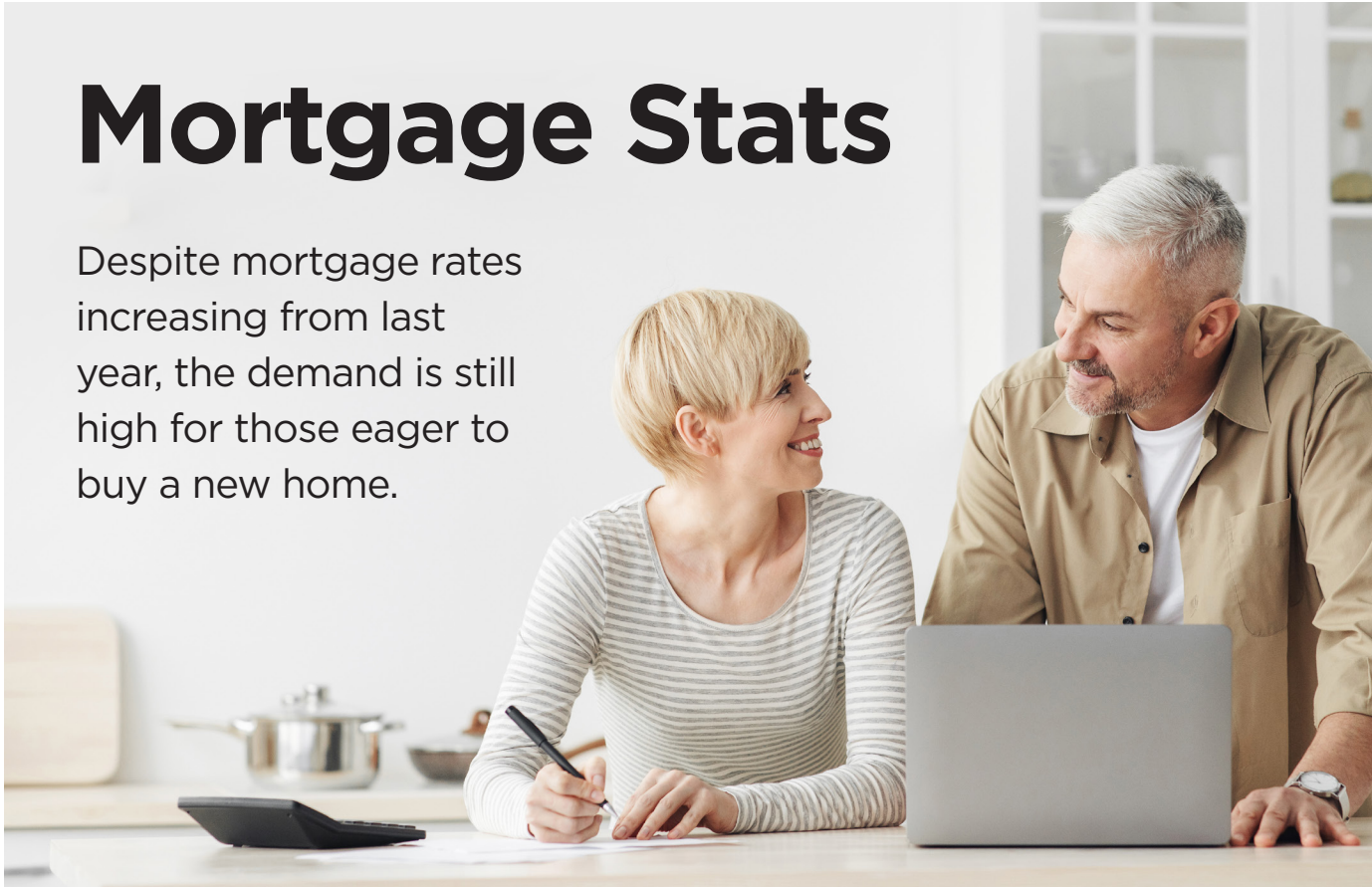
Average Interest Rate on a 30-Year Fixed Mortgage

Despite mortgage rates increasing from last year, the demand is still high for those eager to buy a new home.